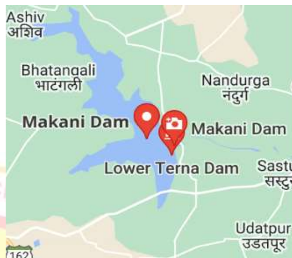
Fig.1 Makni reservoir from Osmanabad district (MS)

The six-month survey (July 2022 to December 2022) has shown that physicochemical parameters of Makni reservoir from Osmanabad district (MS) India shows wide range of results.